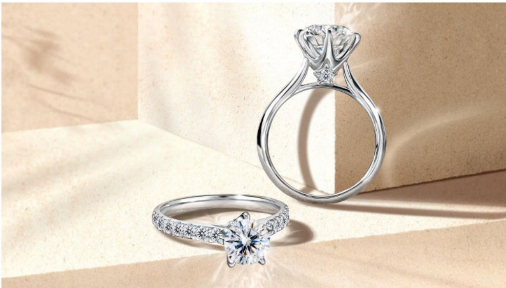
Featuring the iconic star emblem, the AllStar Diamond is a modern masterpiece.

With the AllStar Diamond, the jeweller sought out the most exacting of processes and the finest artisans. The time required to cut the AllStar Diamond may be three times that of others, but when one can achieve almost zero light leakage, the investment is clearly worth it.