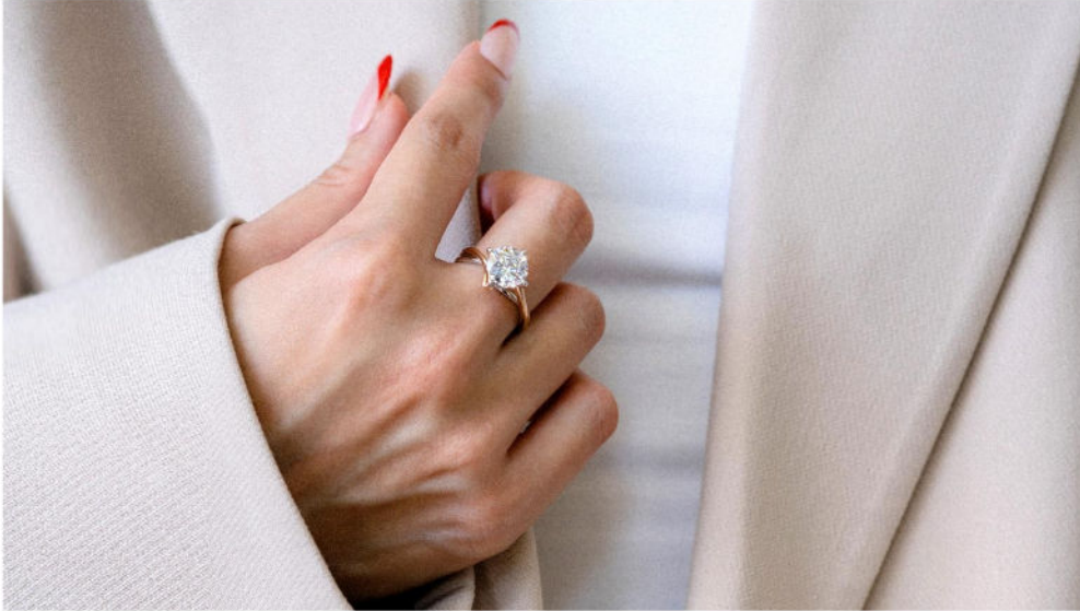
Pair that sharp suit with the AllStar Diamond for a presence like none other.

brighten up any soiree. For a daytime affair, the Infinito AllStar Diamond Ring adds playful sass with an elegant band that ends with a rose gold infinity nod.