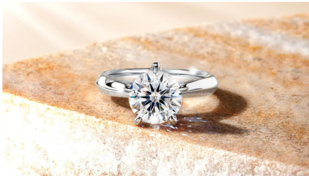
The AllStar Diamond features 101 facets, 10 hearts and 10 arrows to deliver bold flashes of fire and balanced scintillation.